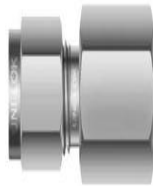
Female Connector UFC