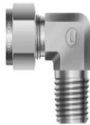
Male Elbow UME